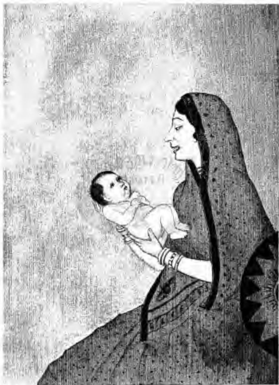
"She began to tend the little baby with the greatest affection."